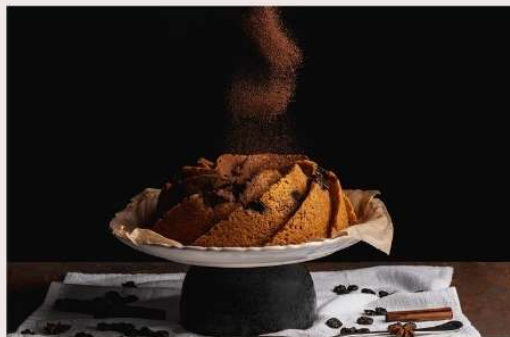
VEGAN CHAI BUNDT