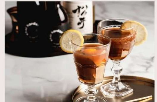
SPICED HOT TODDY