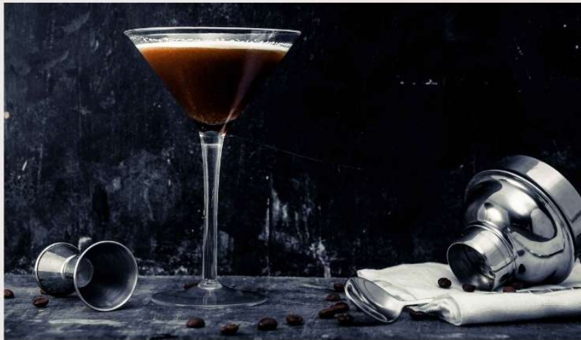
DIRTY CHAI MARTINI

As good as Chai Addict is for your daily chai latte hit, there are so many other delicious ways to use our concentrate to make delectable desserts, chai-licious cakes and devilish cocktails.