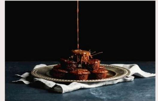
STICKY CHAI PUDDING